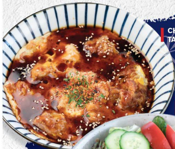
CHICKEN TAMA DON