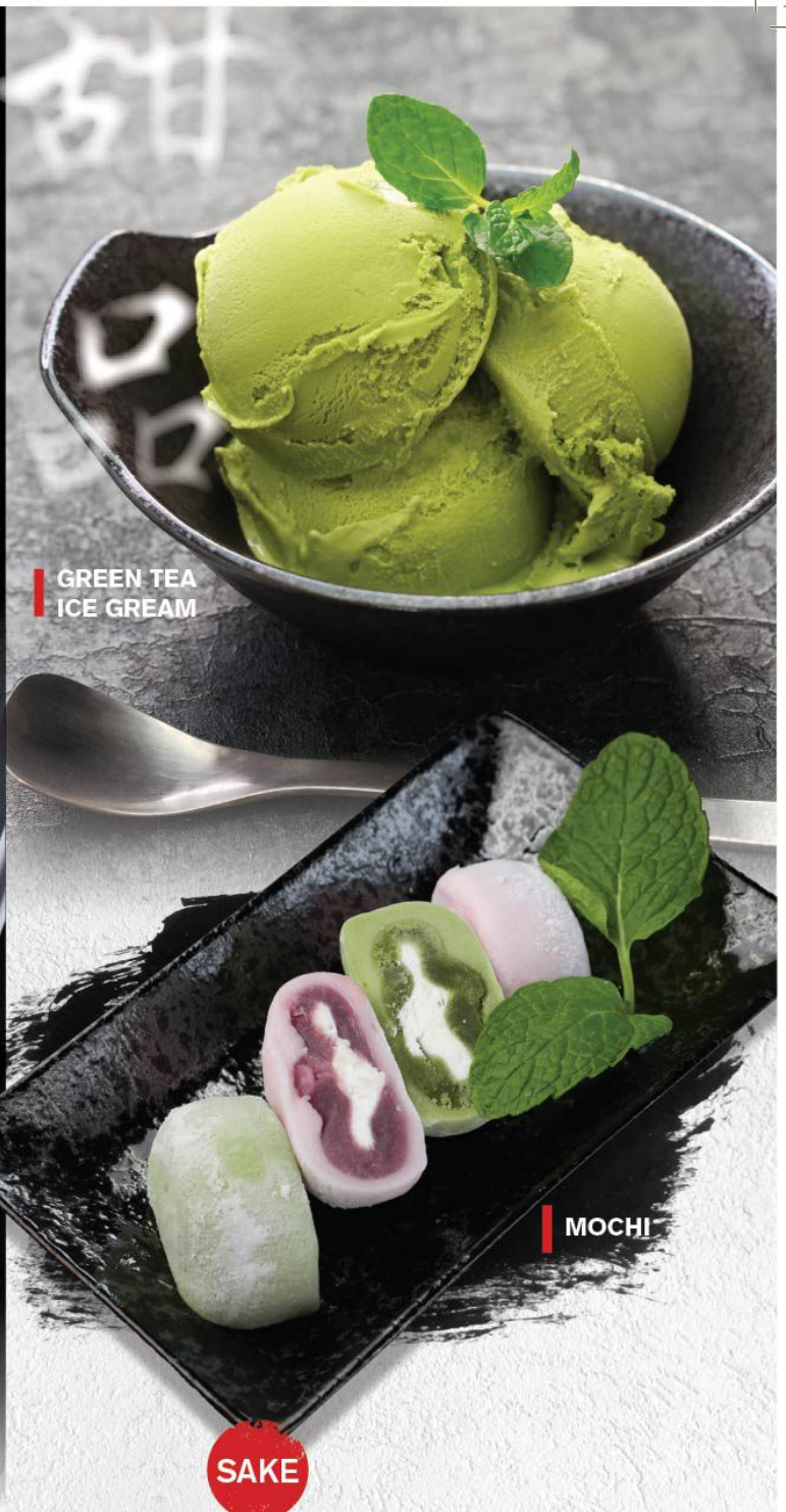
GREEN TEA ICE CREAM