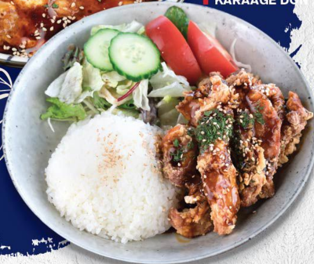
CHICKEN KARAAGE DON